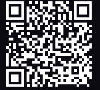
TRB500 360° VIEW